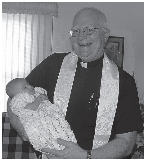
Father Cell holding a baby baptized in a home.