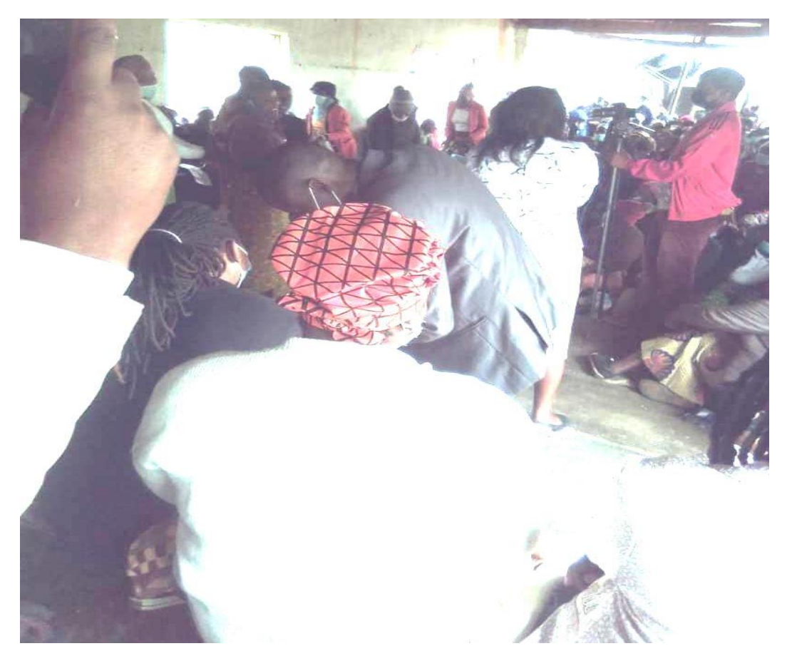
SOME OF THE MEMBERS WHO WERE PRESENT AT THE MEMBER DAY AT ST. GEORGE'S