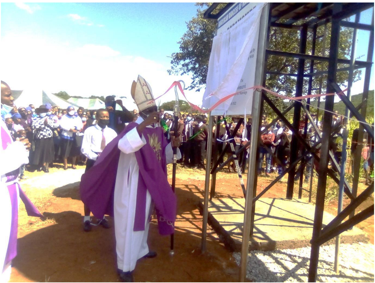
COMMISSIONING OF THE WELL AT CHRIST THE KING DARAMOMBE FARM BY BISHOP GODFREY