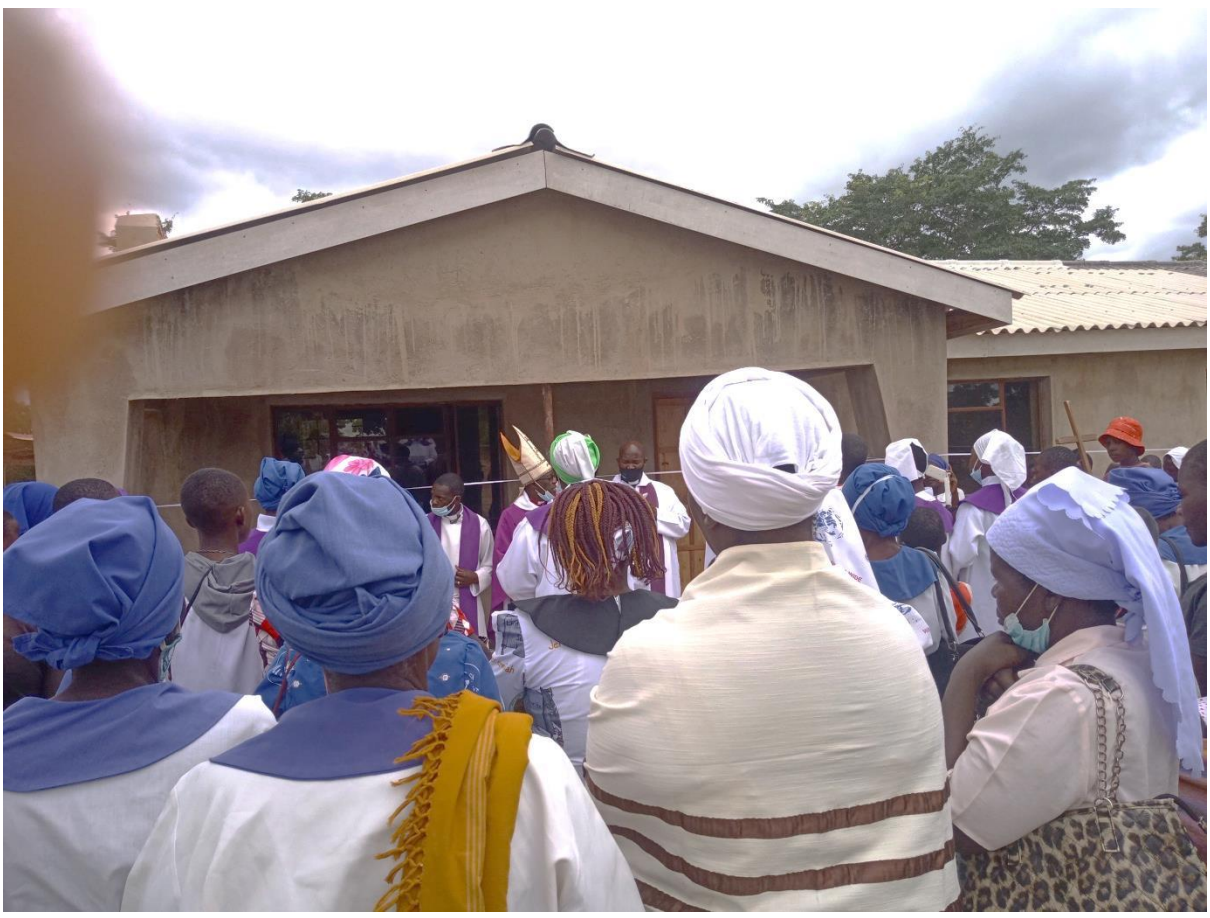
CONGREGANTS AT MUFUDZIWAKANAKA AT THE OFFICIAL OPENING OF THEIR RECTORY