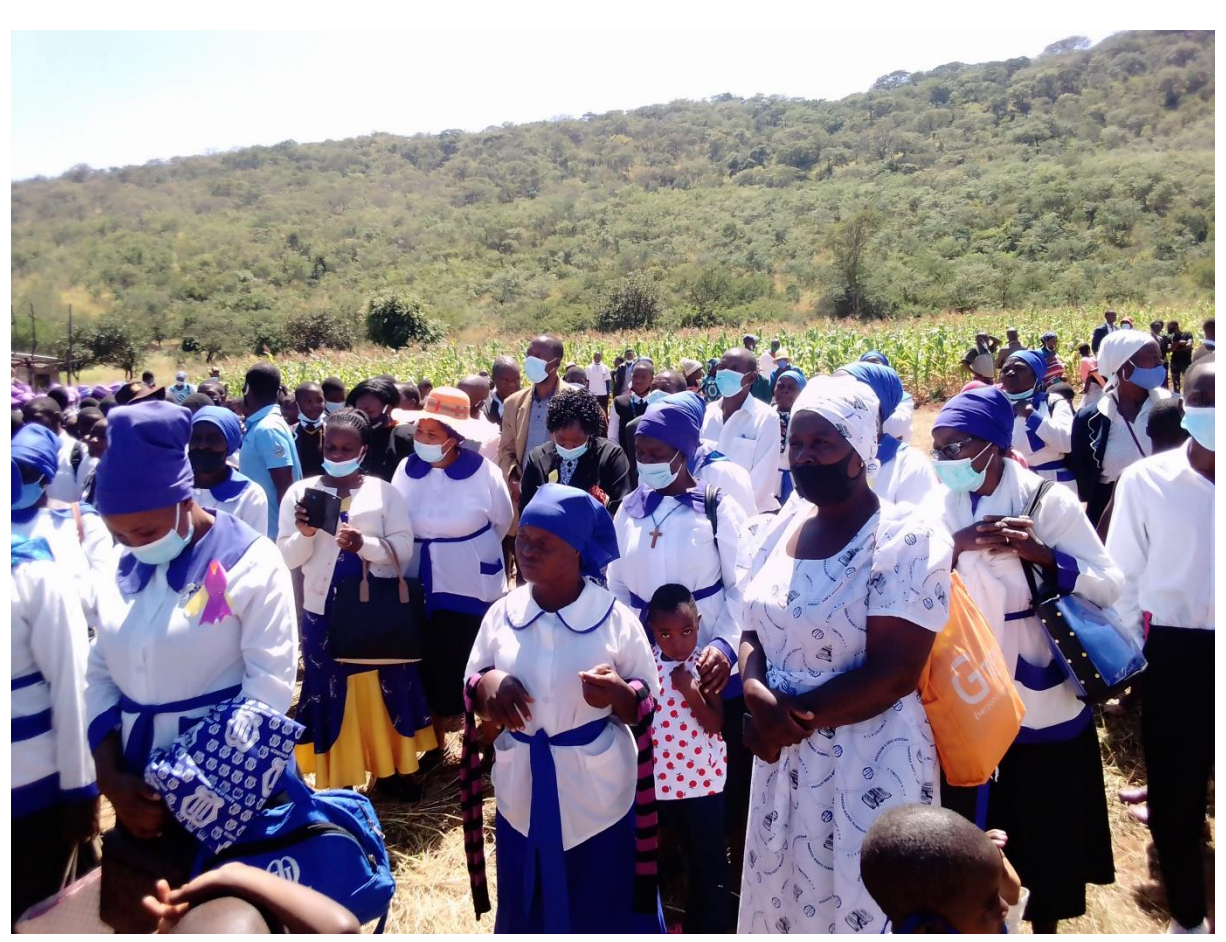
CONGREGANTS WITNESSING THE COMMISSIONING OF THE FIELDS BY THE LORD BISHOP