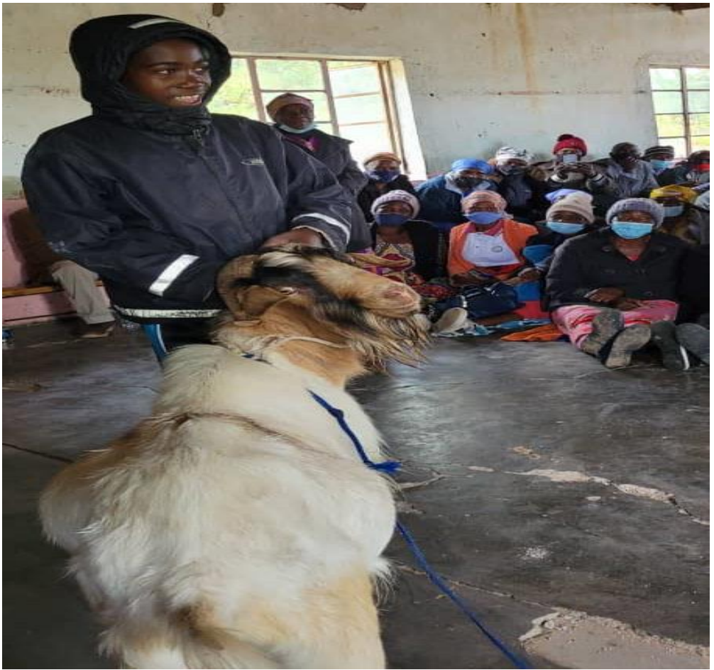
A BOY WHO TESTIFIED HOW HE BOUGHT A GOAT AFTER SAVING MONEY FOR 6 MONTHS