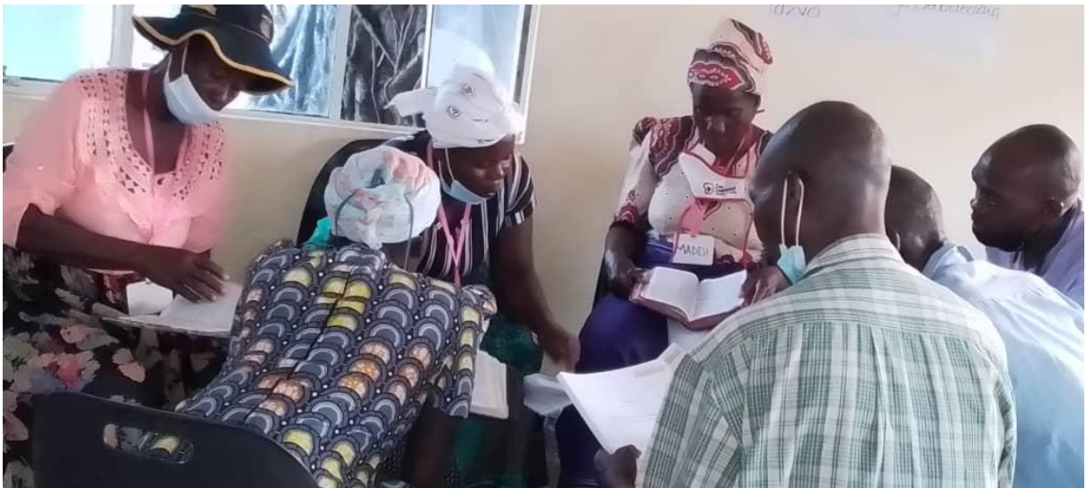
CHURCH FACILITATORS DOING PRACTICE FACILITATION DURING TRAINING SESSIONS