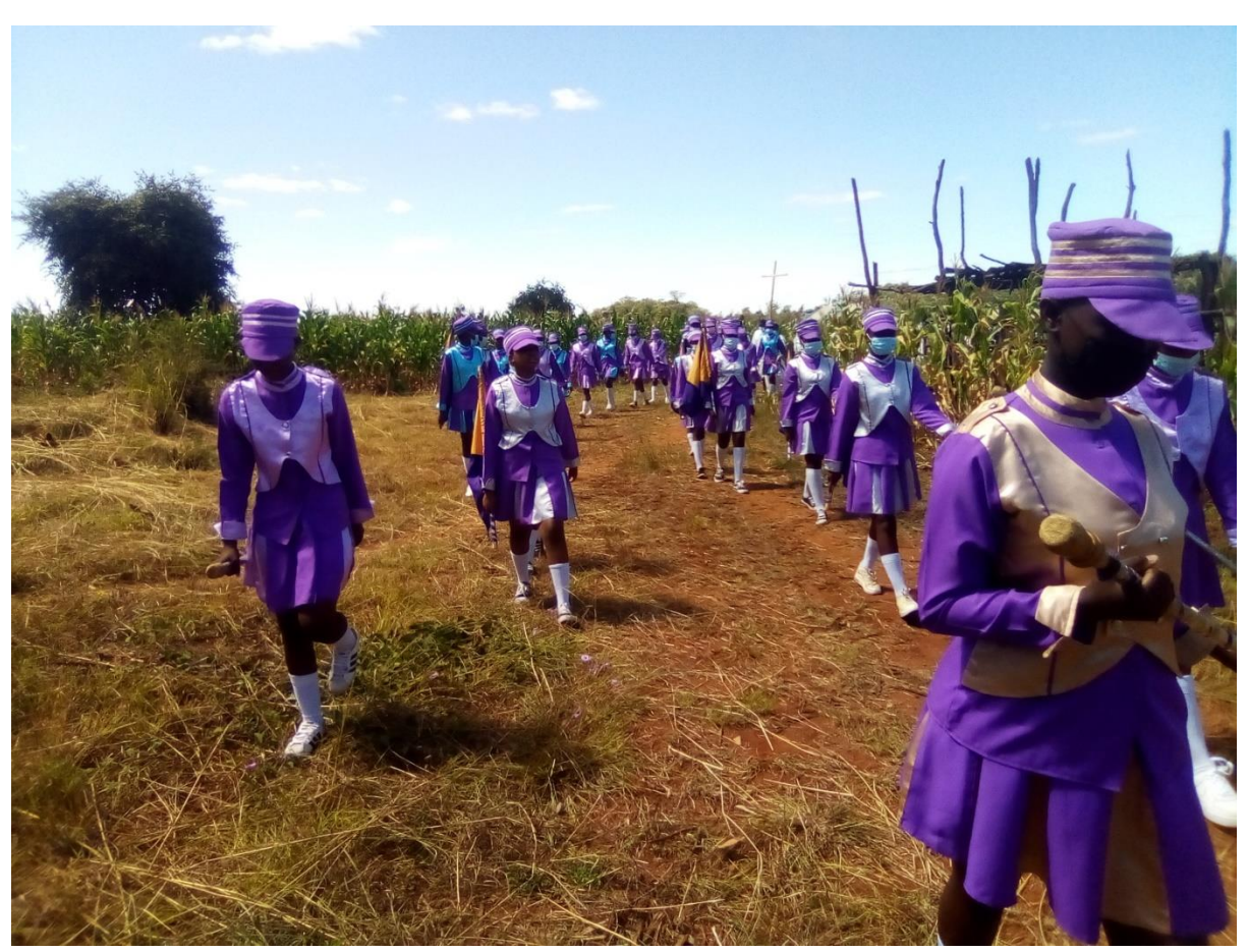
DRUM MARJORETTES LEADING THE PROCESSION.