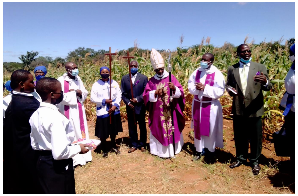
COMMISSIONING OF THE FIELDS BY THE LORD BISHOP