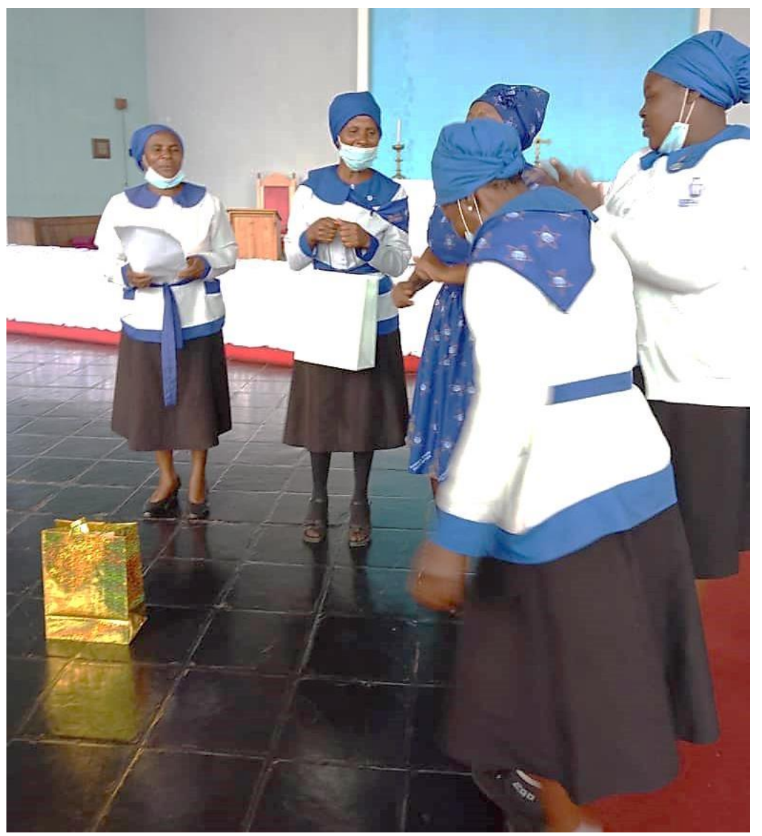
MOTHERS' UNION MEMBERS APPRECIATING A PRIEST'S WIFE (IN WHITE JERSEY) AT LADY CELEBRATIONS HELD AT THE CATHEDRAL OF ST. MICHAEL & ALL ANGELS IN MASVINGO.